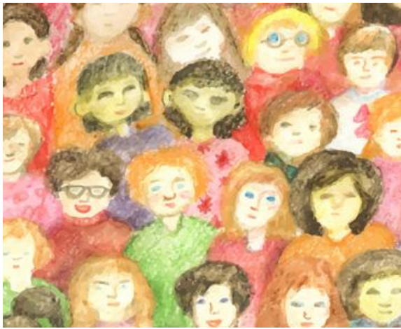
CHAMPS - Call for applications